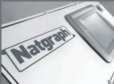
Touch Screen PLC Control

Variable Output of Infra Red Lamps: An optional system can be fitted to control the output (power level), of the Infra Red lamps on a percentage basis, this system can be very useful when the effects of the IR can be critical, or are unknown. This system is controlled by the Touch Screen PLC Control System with a digital output.