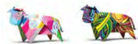
HP SmartStream Mosaic one-of-a-kind designs.